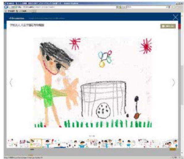
["Hisamitsu Pharmaceutical Tokyo 2020 Olympic and Paralympic Games Supporting Website" where artworks are posted]

The Company has decided to expand this initiative nationwide in light of the warm comments it has received from local communities through the art project activities it had carried out and the increased momentum for the Tokyo 2020 Olympic and Paralympic Games that are only a year away. The program will be conducted as needed, mainly in areas where the Company's branches and sales offices are located.