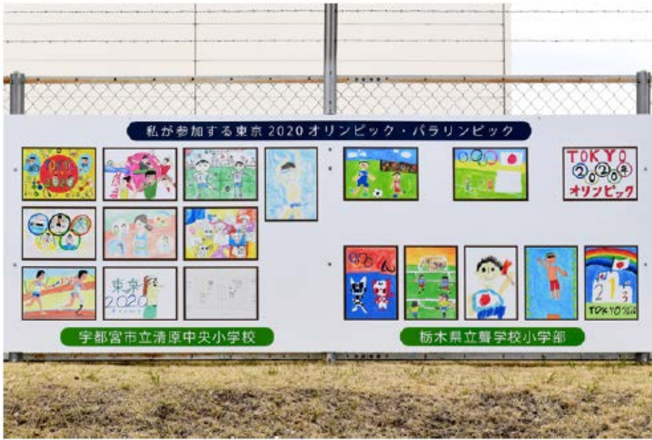
[Artwork exhibited at Utsunomiya Factory]

The Company is committed to contributing to the success of the Tokyo 2020 Games through its activities as an official partner (topical analgesic anti-inflammatory patches), as well as to working towards the realization of society that would create an energetic, healthy future by communicating the benefits of “treatment by formulation application” to everyone involved in the Tokyo 2020 Games, including athletes, Games officials, volunteers and spectators.