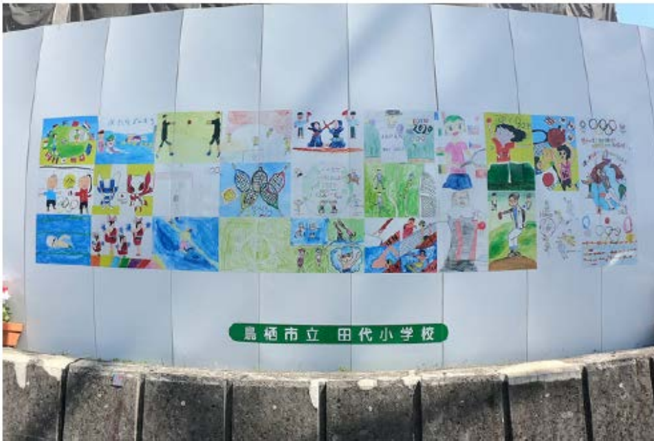
[Work of Tashiro Elementary School (Tosu City)]