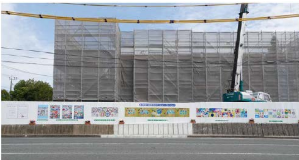
[Exhibition at a temporary enclosure of Hisamitsu Museum]

* Art projects already implemented In October 2018, the Company placed the artworks the local children draw under the theme of "the Tokyo 2020 Olympic and Paralympic Games that I will participate in" at a temporary enclosure section of the Hisamitsu Museum, which was under construction in West Park near the Kyushu Head Office of Hisamitsu Pharmaceutical in Tosu City, Saga Prefecture. At Tsukuba Laboratories in Tsukuba City, Ibaraki Prefecture, and Utsunomiya Factory in Utsunomiya City, Tochigi Prefecture as well, the Company exhibited artworks of local children. Children commented that they were looking forward to the Games and that they wanted Japanese athletes to win medals, while people who looked at the artworks said that the works filled them with warm feelings as they made them feel a bright future and hope.