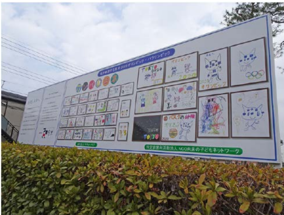
[Artwork exhibited at Tsukuba Laboratories]